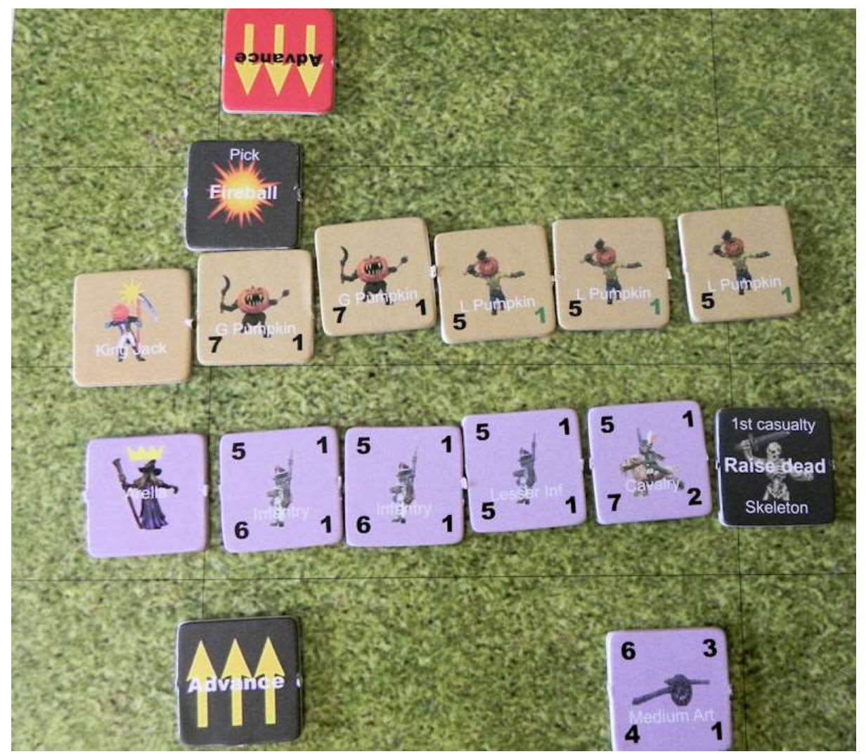
Arella's Gillikans are attacking King Jack's Pumpkinheads. Note that the latter have no ranged fire ability. Both sides have "Advance" orders. Arella has cast Fireball on a Greater Pumpkin unit, which means it must be eliminated first. She has also cast Raise Dead, which gives her a skeleton unit that must be the first casualty on her side. She has left her longer-range artillery out of harm's way.

The third method involves setting up a tabletop scenario using the Wars of Ozz rules. This is CoO in its role as a scenario generator for WoO .