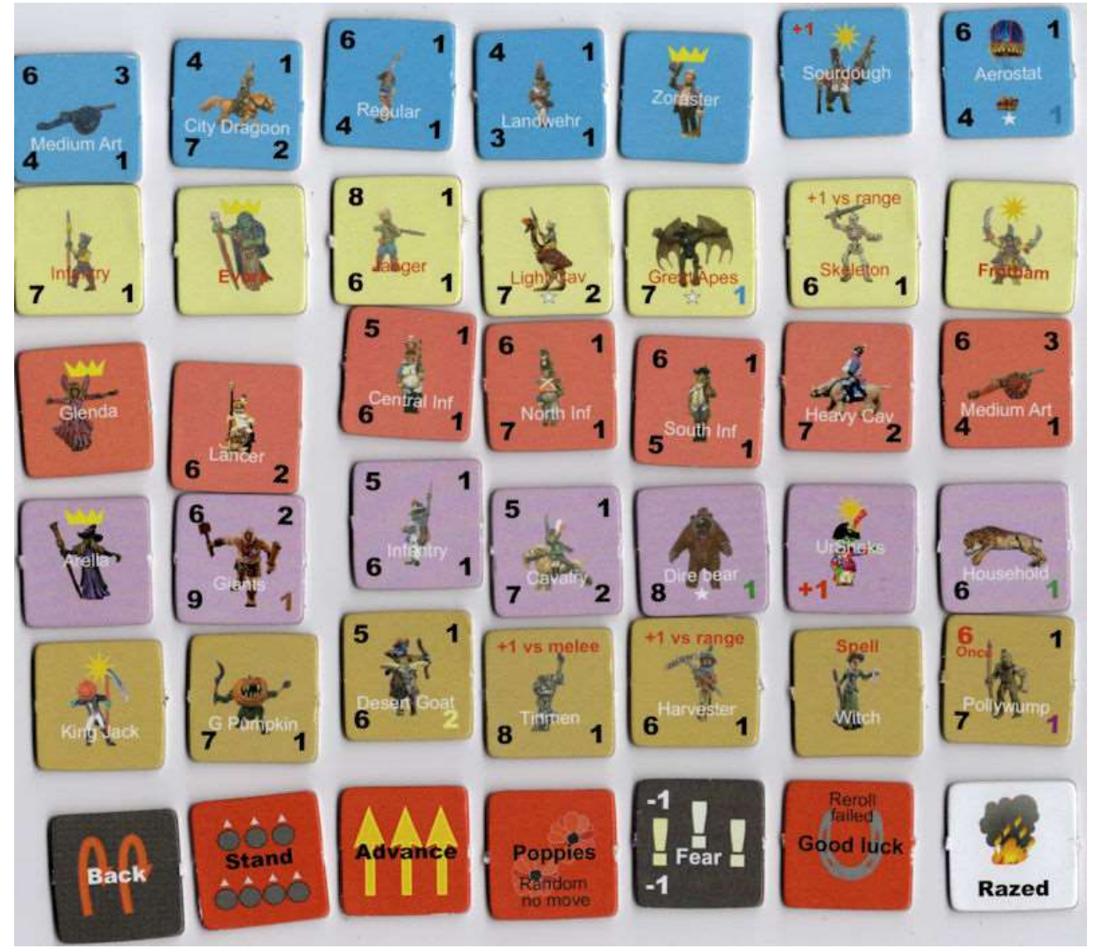
Sample counters: Munchkins (blue), Winkies (yellow), Quadlings (rose), Gillikins (purple), Mercenaries (gold), and markers

The unit counters have solid pastel backgrounds with names and icons of the units. They have four ratings arranged around the corners. Clockwise from top left, these are fire strength, range, (tactical) movement allowance, and melee strength. Some units have noted special abilities. The movement allowance for some units is color coded to indicate its home terrain or that it is a flying unit. There are a large number of mercenary units with their own color background, which they share with the Pumpkinheads.